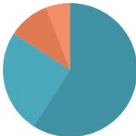
2019 Sources of Income

General Donations (59.19%) Fundraising Events (10.01%) Grant Income (25.01%) Miscellaneous (5.79%)